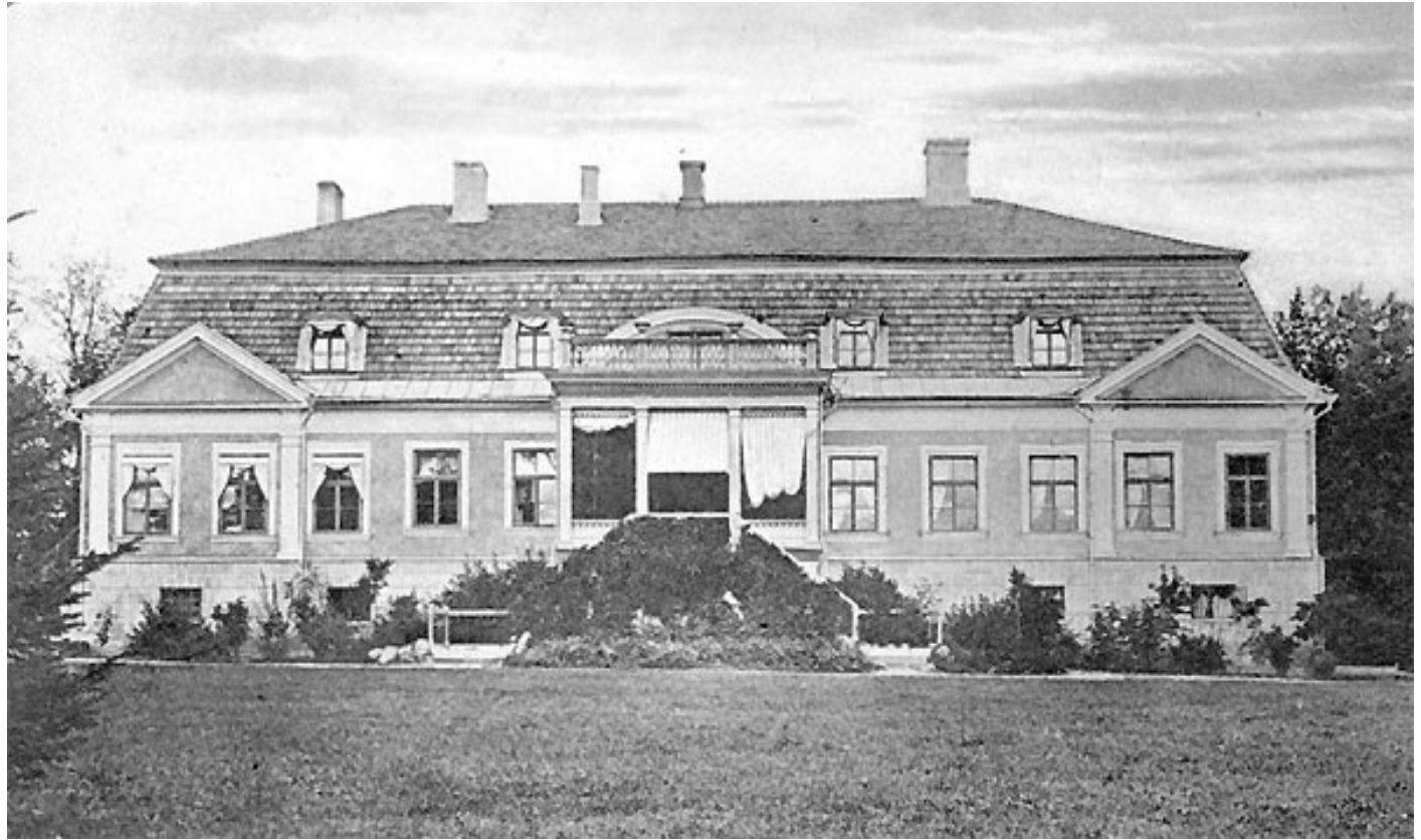
The Rõngu manor