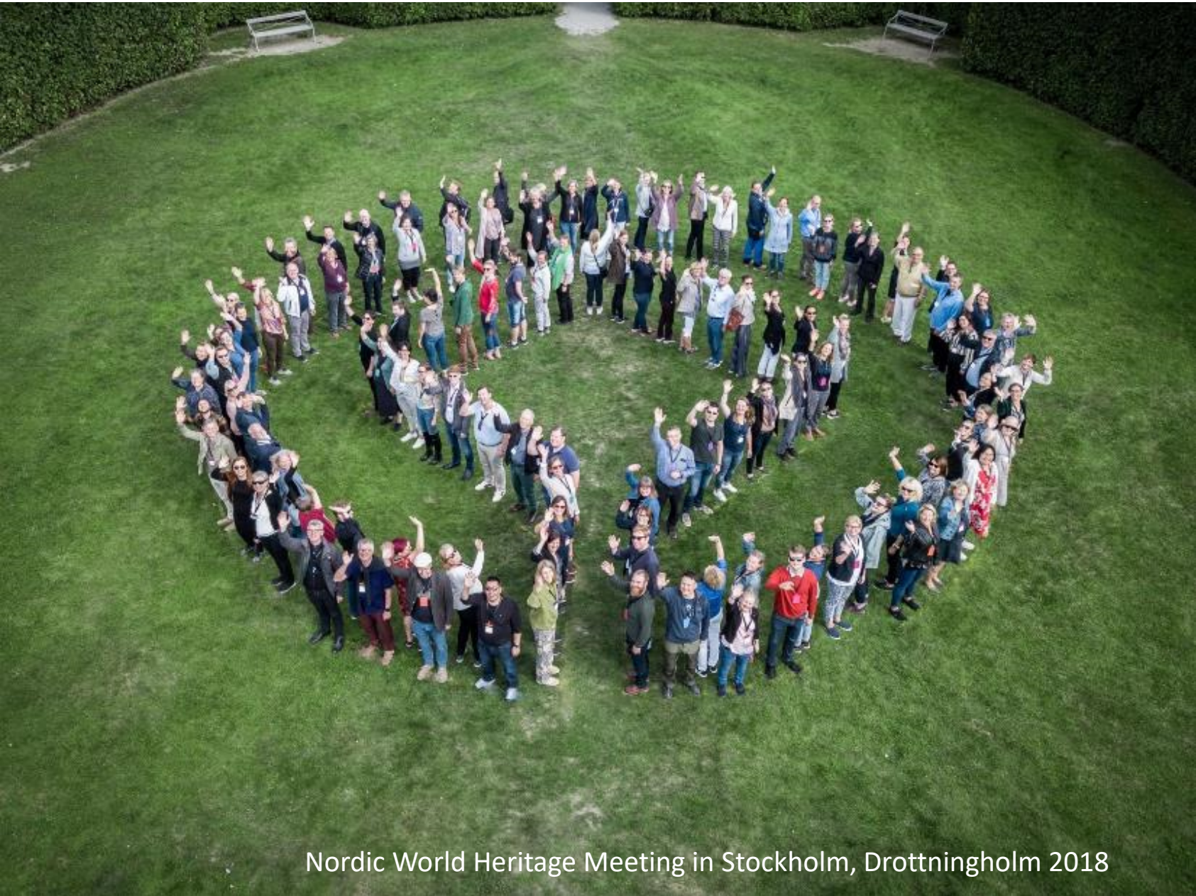
Nordic World Heritage Meeting in Stockholm, Drottningholm 2018