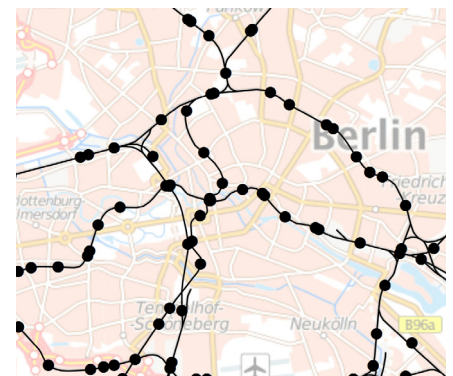
INSPIRE Rail Transport Network