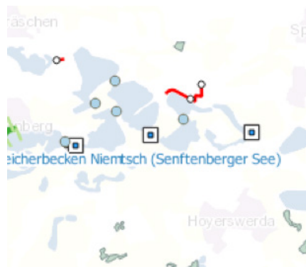
INSPIRE Hydro - Physical Waters